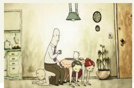
The Employment (2008)