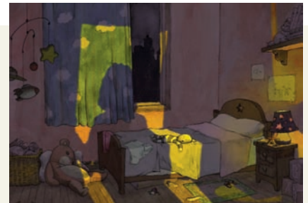
The Face of the Moon (2005)

2006: El Arca. / Patagonik Film Group. Argentina.