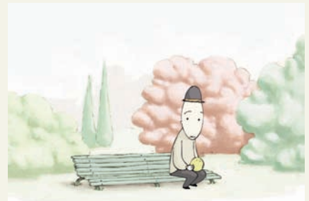
The Bird and the Man (2006)